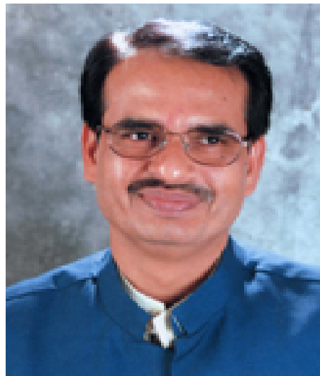
Shri Shivraj Singh Chouhan, Chief Minister, Madhya Pradesh

“ Agriculture in the State would be made a profitable business”